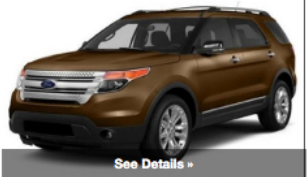
2015 FORD EXPLORER XLT